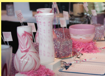
Creations from the Brazee Street School of Glass on display at the Pink Ribbon Luncheon Silent Auction

Brazee Street School of Glass artists dedicated a night to creating all-pink glass items in honor of the Pink Ribbon on September 20. Select items were donated to the Pink Ribbon Luncheon Silent Auction.