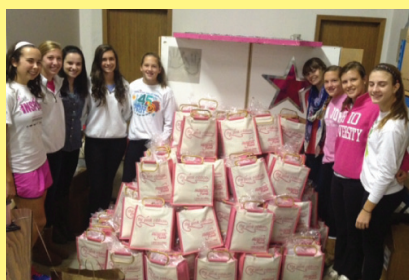
(Right) Students from Summit Country Day help assemble over 150 Pink Ribbon bags.

Day volunteers who spent their day off school assembling Pink Ribbon bags. The girls put together over 150 bags, which will be sent to women recently diagnosed with breast cancer. ■