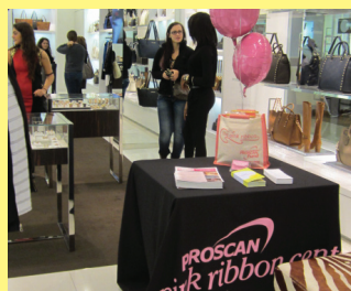
Pink Ribbon weekend at Michael Kors Kenwood Towne Center.

Lilly Pulitzer Kenwood Towne Center held a "Shop & Share" event to support the Pink Ribbon Programs. CCPF received 10% of all sales made on Saturday, October 19th.