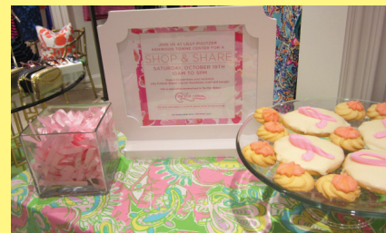
"Shop & Share" event at Lilly Pulitzer.