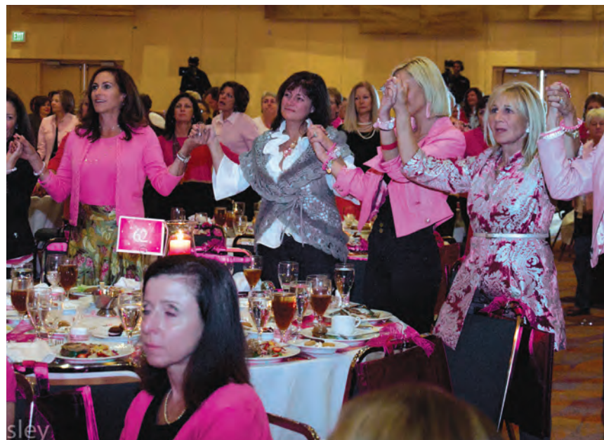
Above: Martina McBride's emotional performance at the Pink Ribbon Luncheon in 2012 ended with the audience standing and holding hands as they swayed to her single "I'm Gonna Love You Through It".