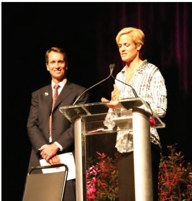
Cris Collinsworth and Olympic medalist Dara Torres at the 2008 Pink Ribbon Luncheon.