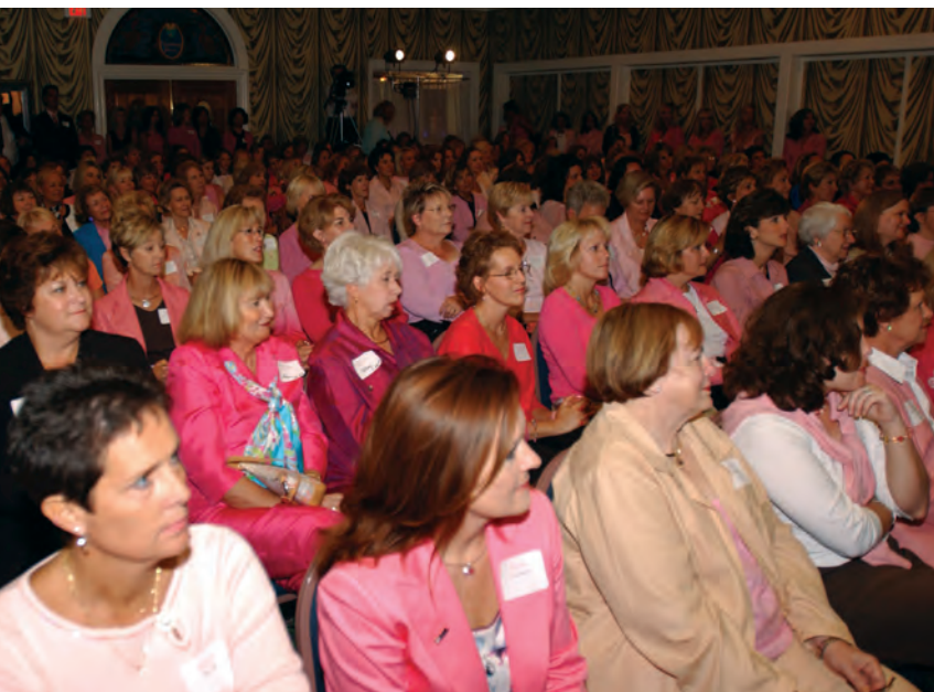
Above: The Pink Ribbon Luncheon is one of the largest afternoon fundraisers in Greater Cincinnati and supports the Pink Ribbon Programs.