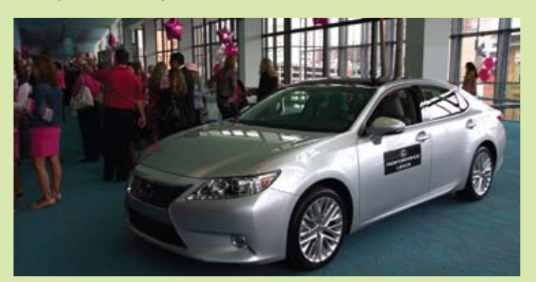
ABOVE: Performance Lexus and Tri-State Cadillac Dealers sponsored the pre-event festivities where two Lexus vehicles and two Cadillac vehicles were displayed.