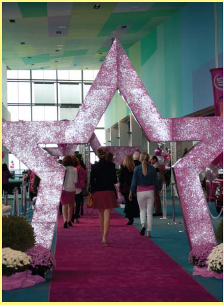
ABOVE: Attendees are given the "Star Treatment" as they walk the pink-carpeted entrance to the 2012 Pink Ribbon Luncheon.

The song had the room full of breast cancer survivors, families, friends, and breast cancer supporters on their feet holding hands and swaying to the music.