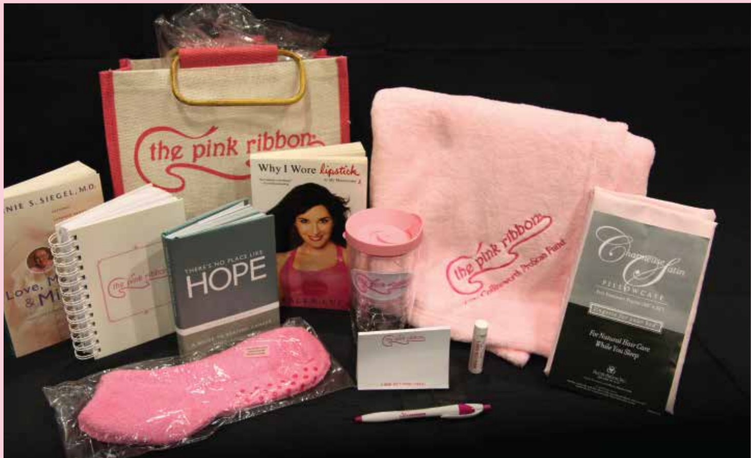
ABOVE: Crusin' for A Cure vehicle outside the ProScan Pink Ribbon Center - Tri-County (top) and Pink Ribbon Bag (bottom).